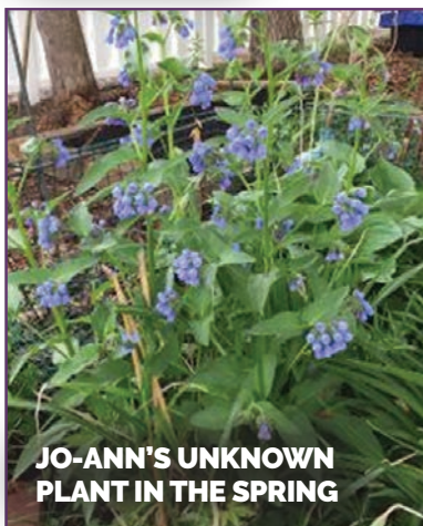
JO-ANN'S UNKNOWN PLANT IN THE SPRING

Your mystery plant looks like a plant called Comfrey. It grows in many parts of the world and has been used for a topical medicine for over 2,000 years. It is an aggressive (i.e., invasive) plant that can grow up to 5 feet tall. It is beautiful because it produces white, blue or purple flowers and large leaves. Since it will rapidly overtake the space it's in near your house, I would recommend moving it to a meadow where it can throw itself around with abandon. Thank you for your question.